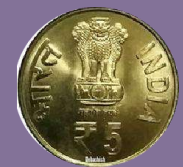
CIRCULATING COMMEMORATIVE COIN