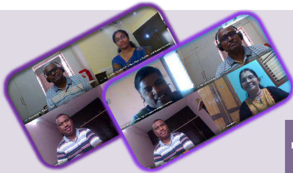
FACULTY MEETING HELD IN JUNE 2020