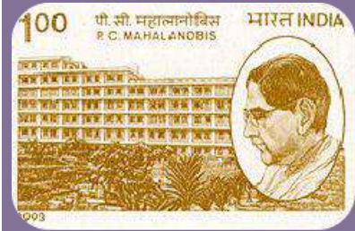
MAHALANOBIS ON A 1993 STAMP OF INDIA.

In 1931, Prof. Mahalanobis set up the Indian Statistical Institute (ISI) for advanced research and training in statistics. Later during the 1950s, ISI shifted to the present premises at Baranagar, a suburb of Kolkata, West Bengal. Mahalanobis was called upon to tackle the problem of flooding after two devastating floods, one in North Bengal in 1922 and the other in Orissa in 1926. This led him to undertake extensive statistical studies of rainfall and floods in Bengal and Orissa covering a span of about sixty years. The studies yielded some of the basic calculations that were later used for the two hydro-electric and irrigation projects in Hirakud and Damodar Valley. Sankhya, The Indian Journal of Statistics , founded by Mahalanobis in 1933 is the official publication of Indian Statistical Institute. He established the National