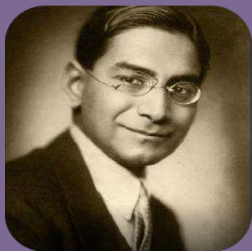
Prof. P.C. Mahalanobis