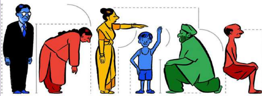
Prof. P.C. Mahalanobis was honoured with this Google Doodle on his 125 th Birth Anniversary on 29 th June, 2018.

sample Survey in 1950. It is a continuing survey in which information is collected year by year with the help of a whole time field organization, spread all over India, and which provides periodic estimates on social and economic factors affecting the national economy. In 1958, he found a simple but very effective technique known as Fractile Graphical Analysis. Mahalanobis was one of the first people in the country to recognize the importance of machines – mechanical, electrical as well as electronic – to make fast, accurate and complicated calculations with masses of figures.