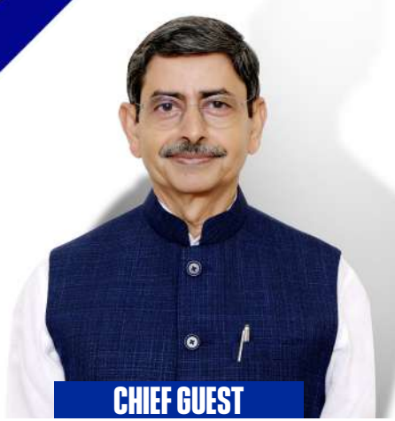
Thiru. R. N. Ravi Hon'ble Governor of Tamil Nadu