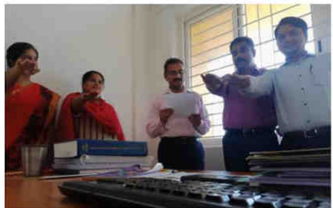
Faculty members take the Oath Against Corruption