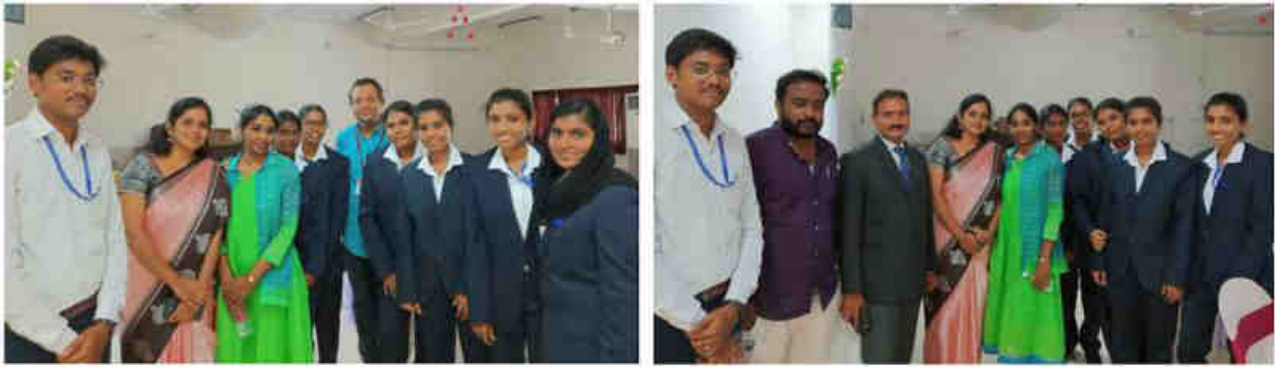
Students and staff organizing hospitality at the National Education Policy Conference