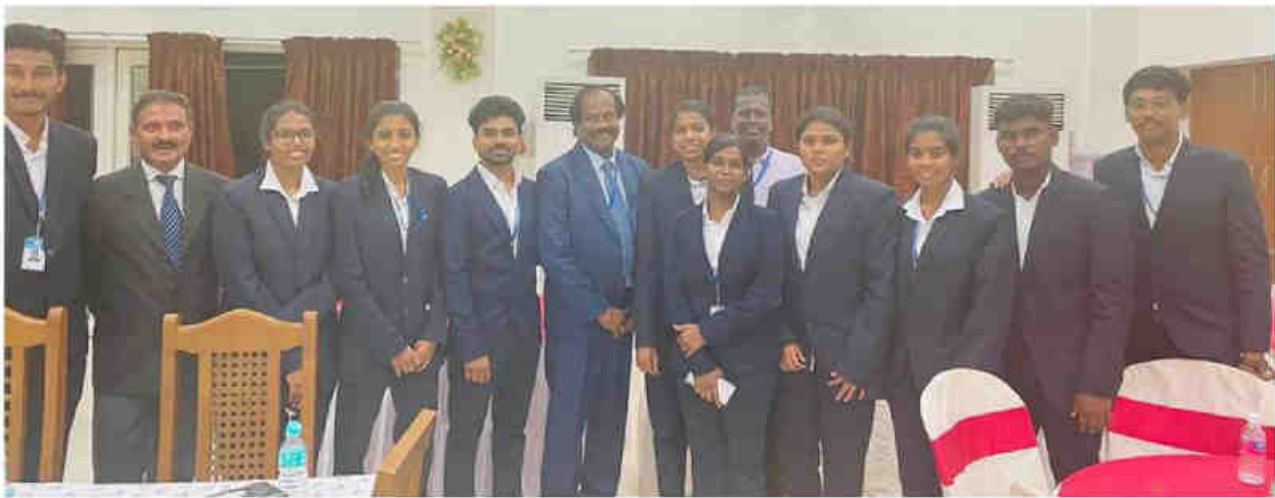
The Hon'ble Vice Chancellor and students at the grand lunch to appreciate the THM Department for excellent management of the NEP Conference