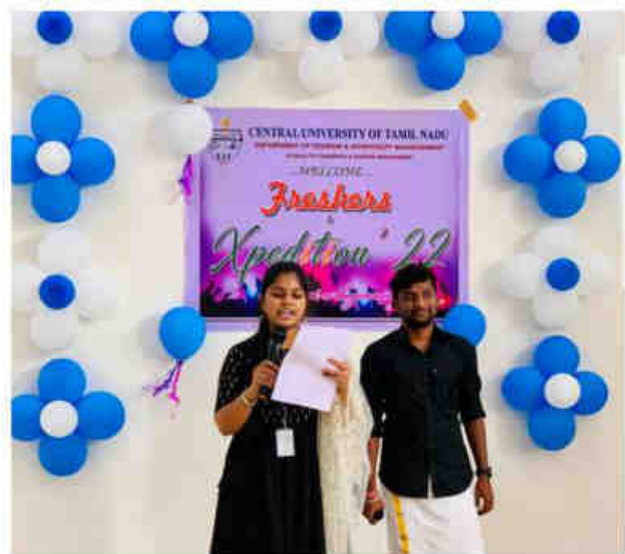
Senior students welcoming the freshers