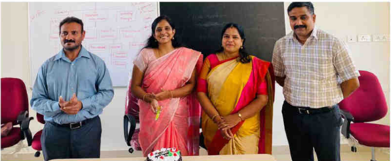
Celebration to mark the re-commencement of offline classes after the lockdown