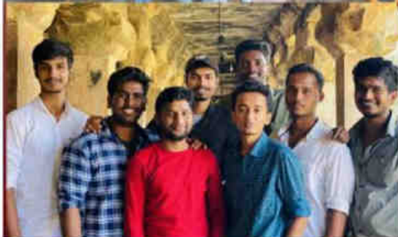
2nd year MBA THM students at UN World Heritage Site Thanjavur