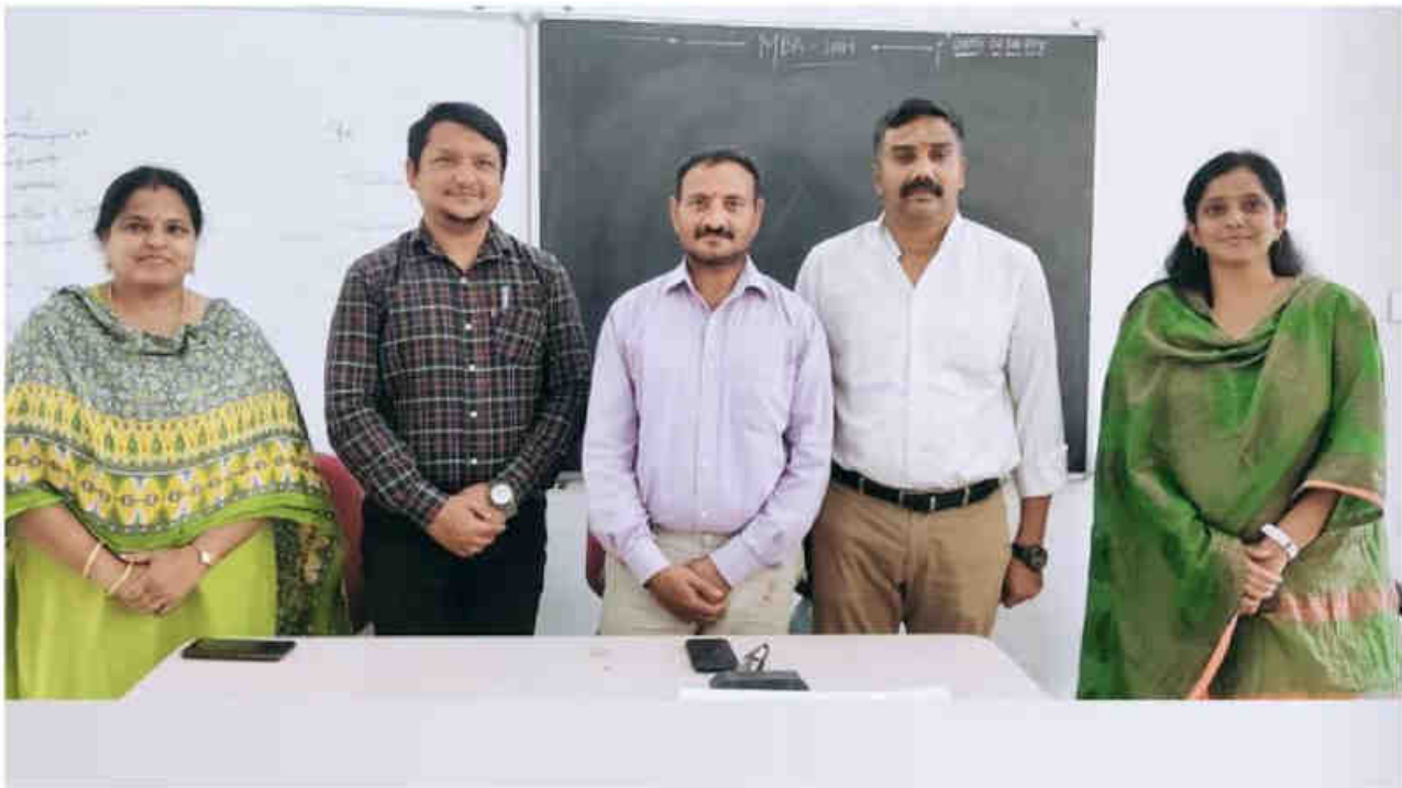
Teaching Faculty of the Department