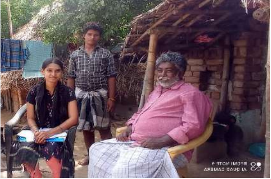
Data Tracking from Members and Non-Members of FPC