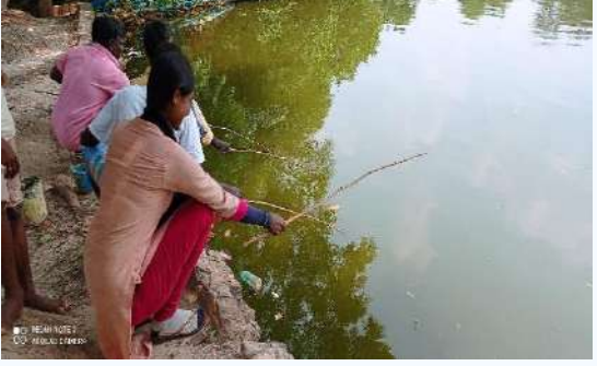
Enjoying the Joy of Greenery and Fishing