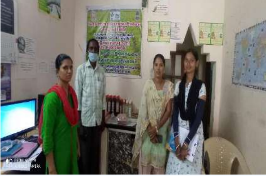
Discussion with CEO & Executives at Nagapattinam and Trichy