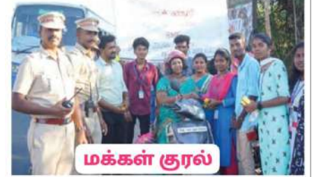
மக்கள் குரல் சாலை விபத்துகளைத் தடுக்க திருவாரூரில் ஹெல்மெட் விழிப்புணர்வு நிகழ்ச்சி