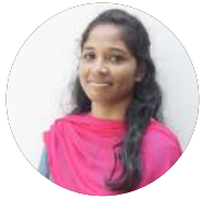
SRINIDHI S II DJMA

In a resounding display of environmental stewardship and collaborative effort, ELGI and ATS, in conjunction with ELGI School and EVTS Students, embarked on the #whatsyourfinishline challenge, spearheading a significant initiative to combat climate change. The culmination of their joint endeavor saw the planting of nearly 2000 Neem and Mahogany trees in Appanaickenpatti, Coimbatore, marking a remarkable milestone in the ongoing battle against climate change. This ambitious project underscores the power of collective action in addressing environmental challenges. By mobilizing resources and expertise from both corporate and educational sectors, the initiative aimed to contribute substantially to green initiatives while fostering a sense of responsibility towards environmental sustainability. The collaboration between ELGI, ATS, and educational institutions not only highlights the importance of cross-sectoral partnerships but also exemplifies a shared commitment to environmental conservation and